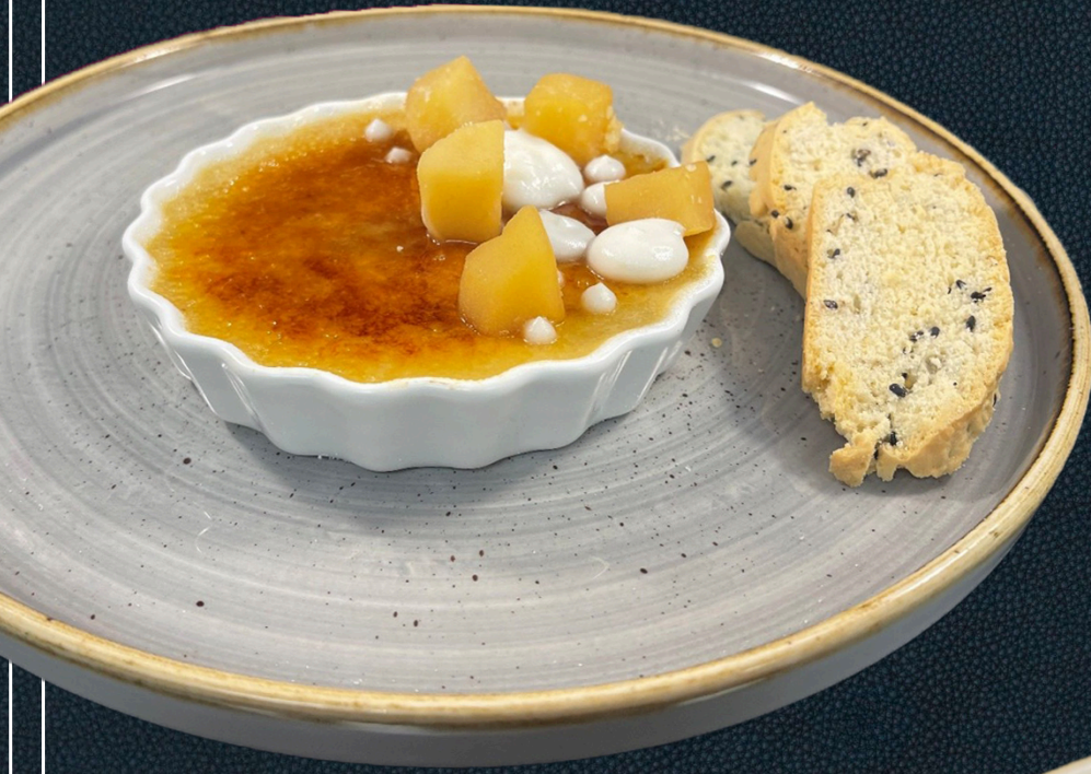
Spiced Creme Brulee