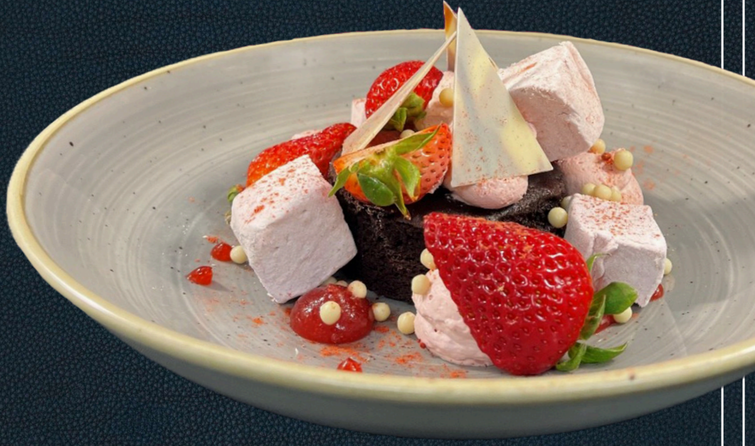
Black Bean Chocolate Cake